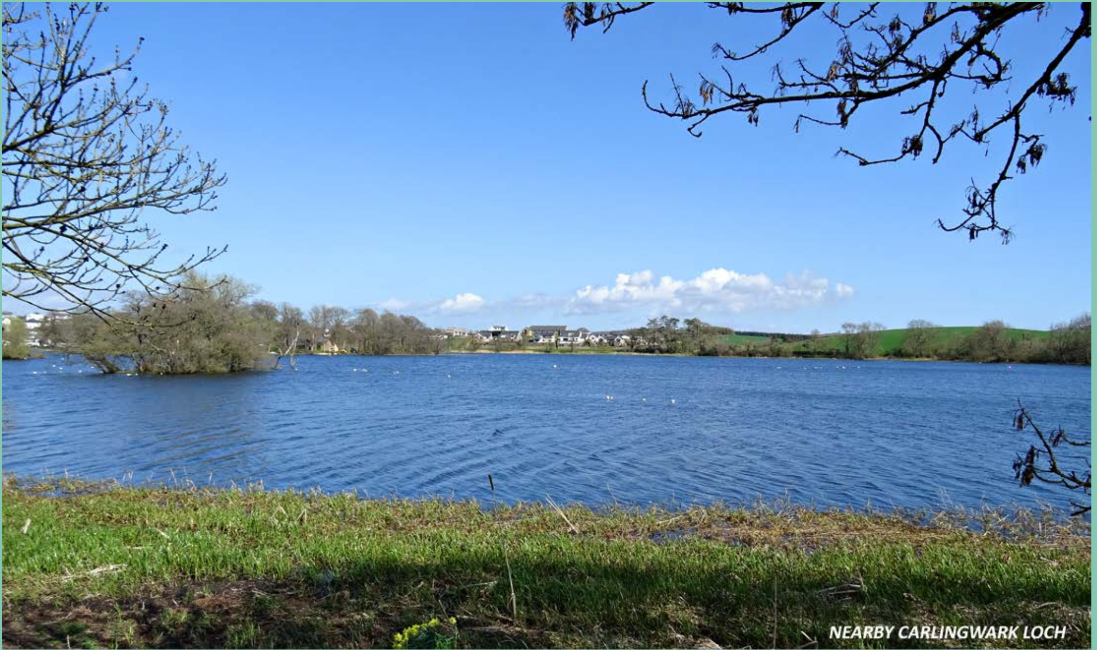
NEARBY CARLINGWARK LOCH